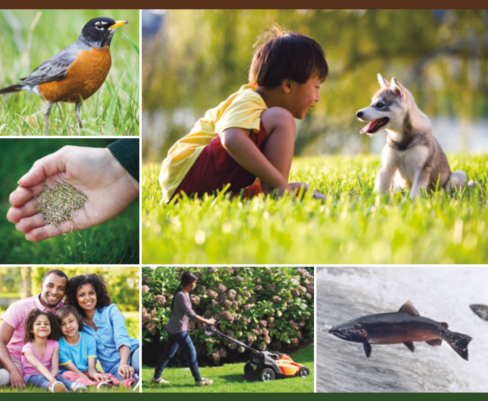
Easy practices for healthy lawns, healthy families and a healthy environment